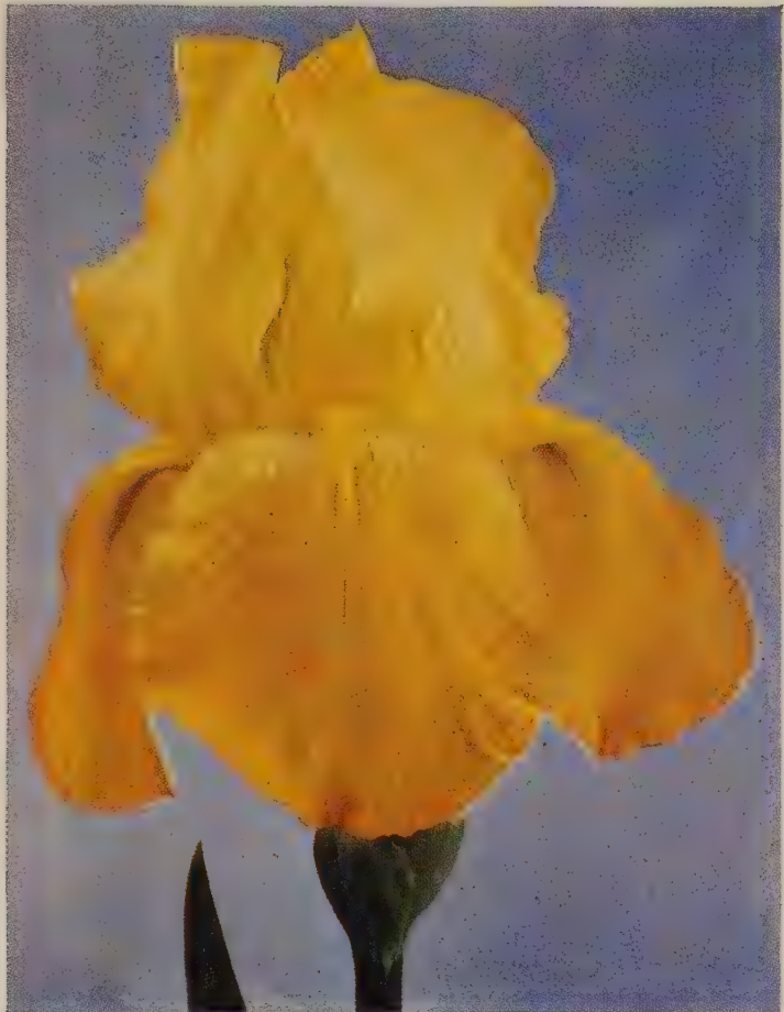
Berkeley Gold—$2.50 (Page 10)